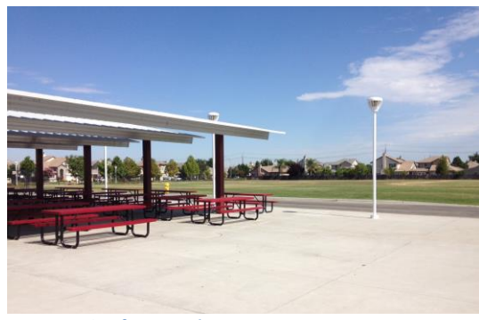
Gym Location from Food Court