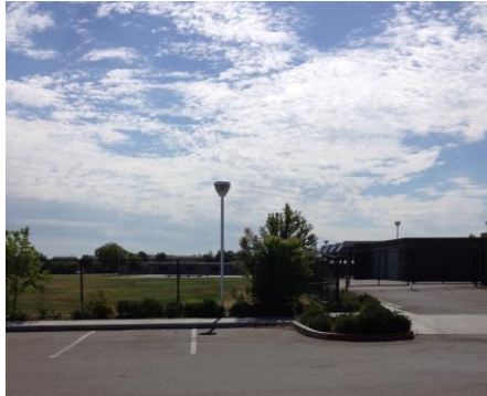
Gym Location View from Windsong Dr.

Applications are available on the website.