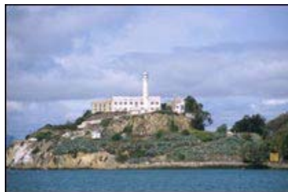
Alcatraz Island, now part of the Golden Gate National Recreation Area, draws over a million visitors each year

Alamo: "poplar." This tall softwood tree gave its name to a number of U.S. places, including the memorable chapel-fort in Texas and the town of Los Alamos in New Mexico, where atomic bombs were produced.